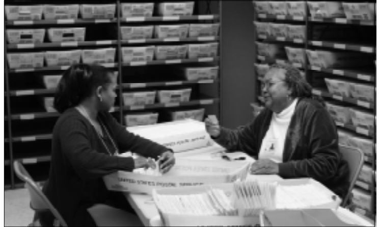
Hundreds of IBT election workers count tens of thousands of ballots cast by Teamsters in the 2006 IBT Election.

At the end of the next term, James P. Hoffa will be the longest serving IBT General President since his father, James R. Hoffa, was elected to three terms and served from 1957-1971.