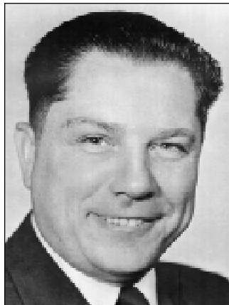
James R. Hoffa

If you have questions, contact the James R. Hoffa Memorial Scholarship Fund at (202) 624-8735 or via e-mail at scholarship@teamster.org